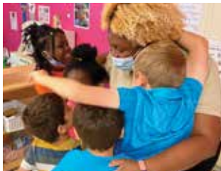
Above left to right: Overtown Youth Center, Habitat for Humanity of Greater Orlando & Osceola County, The Isaiah Project, Abounding in Faith.